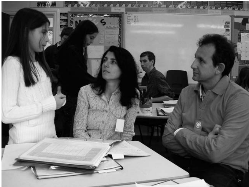
Several student-led conferences take place in classroom

Student-led conferences in a school with a very diverse population provide the opportunity for students to guide their parents or guardians through their recent “journey of learning”, using their mother tongue. Conference tables set up in each classroom are prepared with laminated question prompts translated into multiple languages, for the parents to refer to. The students take their parents or guardians to the tables, where they explain the objectives of the conference: to highlight their “journey of learning”, their personal growth, their challenges and their achievements. The students guide the adults through the contents of their portfolios, discussing the objectives of each included item and indicating their successes and room for growth. Each student has a “personal target sheet” to fill out as they reflect on successes and challenges. Teachers are present but stand apart from the conferences. As they guide the parents or guardians from room to room, the students have a “passport” to be signed by all teachers, to ensure that their development relevant to all areas of the curriculum is discussed.