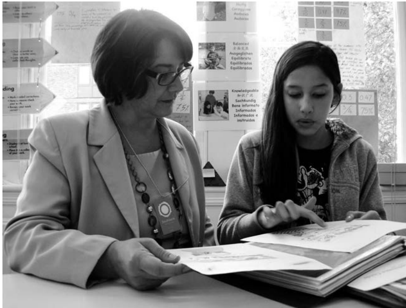
Student discusses exhibition portfolio with mentor

In the final year of the PYP the students participate in a culminating project, the PYP exhibition. This requires that each student demonstrates engagement with the five essential elements of the programme—knowledge, skills, concepts, attitudes, action. It is both a transdisciplinary inquiry conducted in the spirit of personal and shared responsibility, as well as a summative assessment activity that is a celebration and rite of passage, symbolic and actual, from the PYP into the middle years of schooling (example 16).