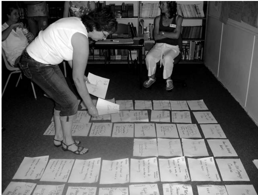
Teachers negotiate placement of units in programme of inquiry

refining a complete programme of inquiry. The proposed units of inquiry at each year level need to be articulated from one year to another. This will ensure a robust programme of inquiry that provides students with experiences that are coherent and connected throughout their time in school (examples 11 and 12).