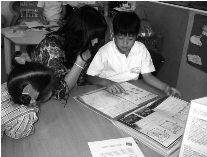
Younger sister attends brother’s parent conference

The prime objective of assessment in the PYP is to provide feedback on the learning process. Bruner states that students should receive feedback “not as a reward or punishment, but as information” (Bruner 1961: 26). Teachers need to select assessment strategies and design assessment instruments to reflect clearly the particular learning outcomes on which they intend to report. They need to employ a range of strategies for assessing student work that take into account the diverse, complicated and sophisticated ways that individual students use to understand their experiences. Additionally, the PYP stresses the importance of both student and teacher self-assessment and reflection (examples 14 and 15).